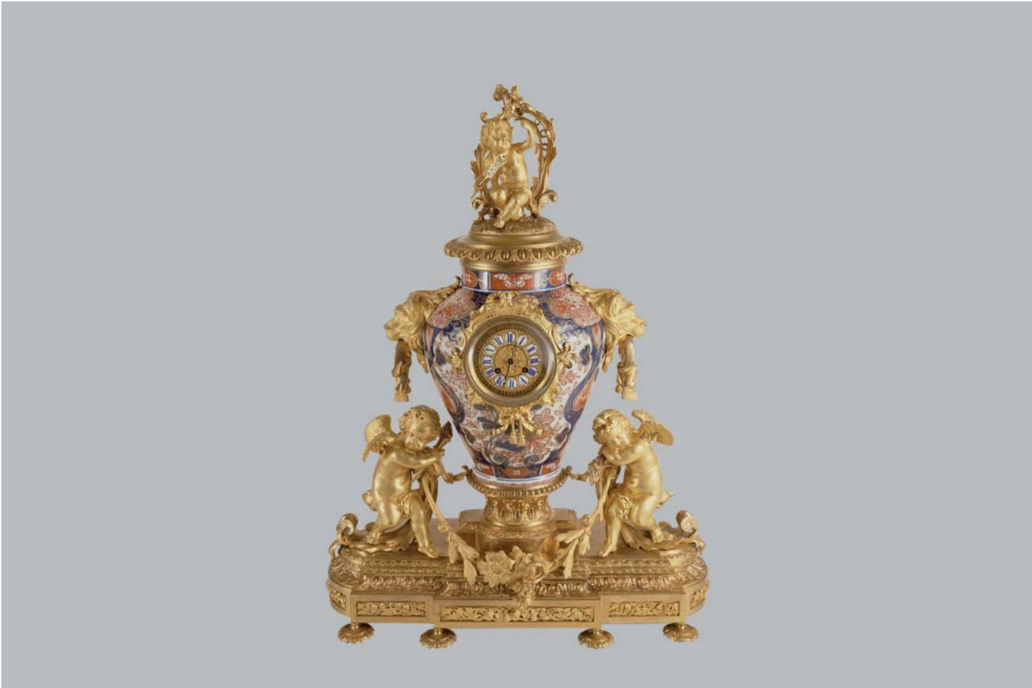
19th century mantel clock. Banco de España collection.