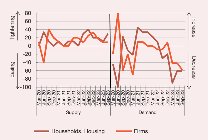
Chart 1 Bank lending, supply and demand (a)